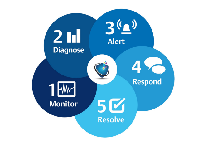
The DeltaV System Health Monitoring Service process.

Online monitoring of critical system assets: Hundreds of health checks are repeatedly and automatically performed on control system assets such as controllers, DCS servers and workstations, SIS controllers, switches, firewalls, DeltaV Virtualization infrastructure, CIOCs, UPSs, and non-DCS servers and workstations.